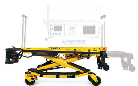
Power-PRO IT Cot