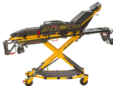
Performance-PRO XT Cot