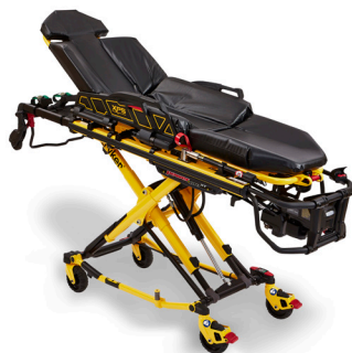
Power-PRO XT Cot